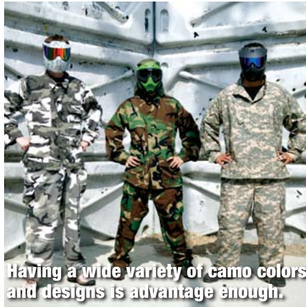
Having a wide variety of camo colors and designs is advantage enough.

During one large game I hid with a teammate and watched the opposing team run past us both to get our main base. Once they all passed us, they never turned around. Why should they? They thought they had gotten everyone behind them. So we walked up the trail, in plain view, and surrendered 30 or so people between the two of us. Literally, they never saw us coming because we came up behind their backs. They never heard