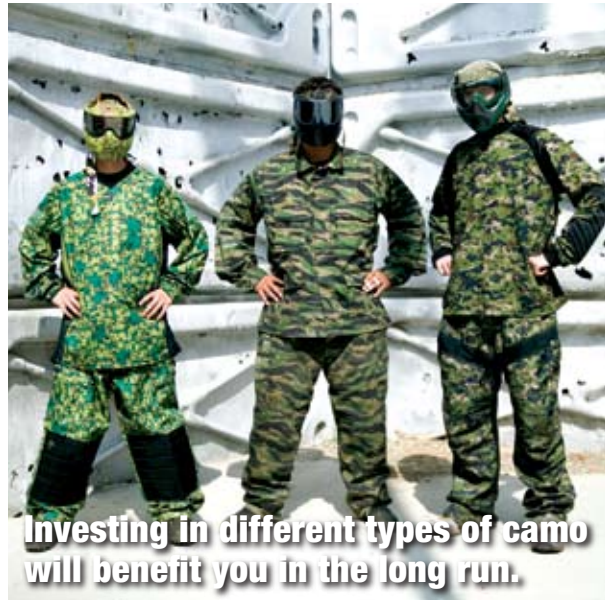
Investing in different types of camo will benefit you in the long run.

Next question. How much of a threat are you looking at? Is the other team looking right at you,